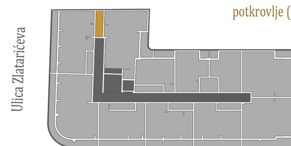
potkrovlje (donji nivo)/level 1